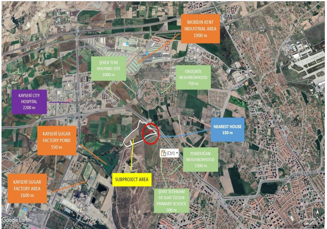
Figure 2: Map of Settlements and Facilities Close to the sub-project Area

The sub-project site, surrounding settlements and access roads were assessed to determine the Area of Impact (IA). When a circle with a diameter of 200 m was drawn from the sub-project area to determine the Area of Impact (IA), the closest settlement was a few houses located within the Yenidoğan neighborhood boundary. Houses in the Yenidoğan neighborhood are approximately 150 m from the subproject area. Considering the environmental and social impacts that will be caused by the Subproject, it has been determined that local people living in these neighborhoods will be affected by dust and noise, especially from topsoil stripping. Therefore, these neighborhoods are included in the EA of the Subproject. In addition, although the Şehit İstihkam Er Suat ÖZGAN primary school, which is 500 m away from the sub-project area, is not located within the sub-project impact area, it has been determined that the roads used for transportation and logistics are not between the roads used by school students. The fact that part of the construction phase coincides with the summer school holidays will ensure that school students will not be affected by dust and noise risks caused by topsoil stripping and steel pile driving works.